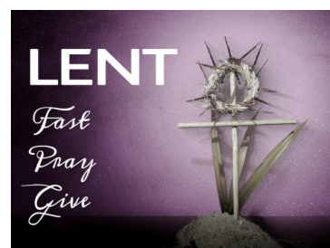
Recipe for a Good Lent