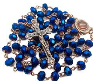
March 3 Rosary Group